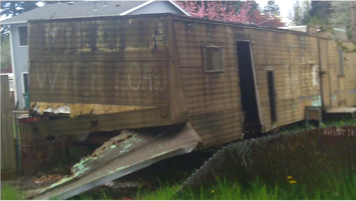
Abandoned Single Wide East of West Lane along the Crown Zellarbach Trail. We can do better.